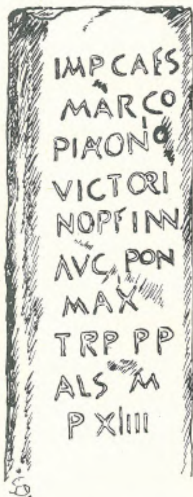
THE INSCRIPTION ON THE ROMAN MILESTONE.