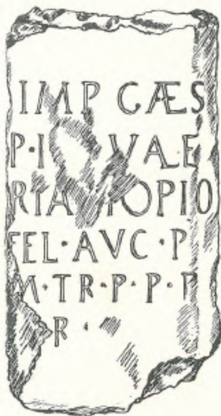
ROMAN MILESTONE OF VALERIANVS.

Below this is a detached letter R. In the absence of any numerals it is believed to indicate that this milestone was the first one on the way to RATÆ. The modern name of that city is Leicester, an important town on the Foss Way, where many evidences of Roman occupation have been discovered.