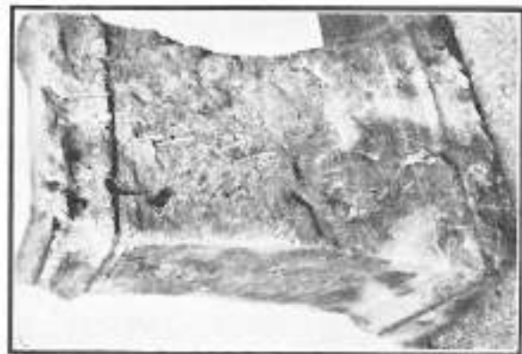
ALTAR, No. 29.