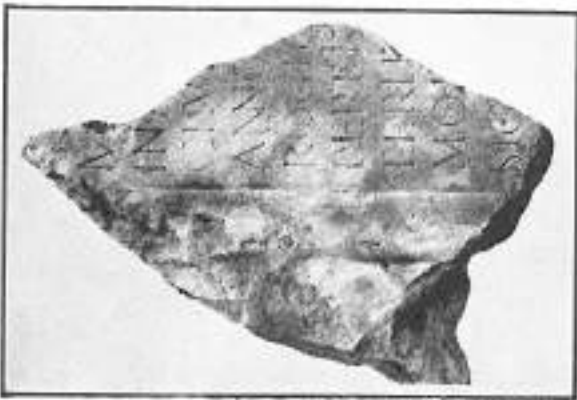
FRAGMENT OF TOMBSTONE. No. 28.