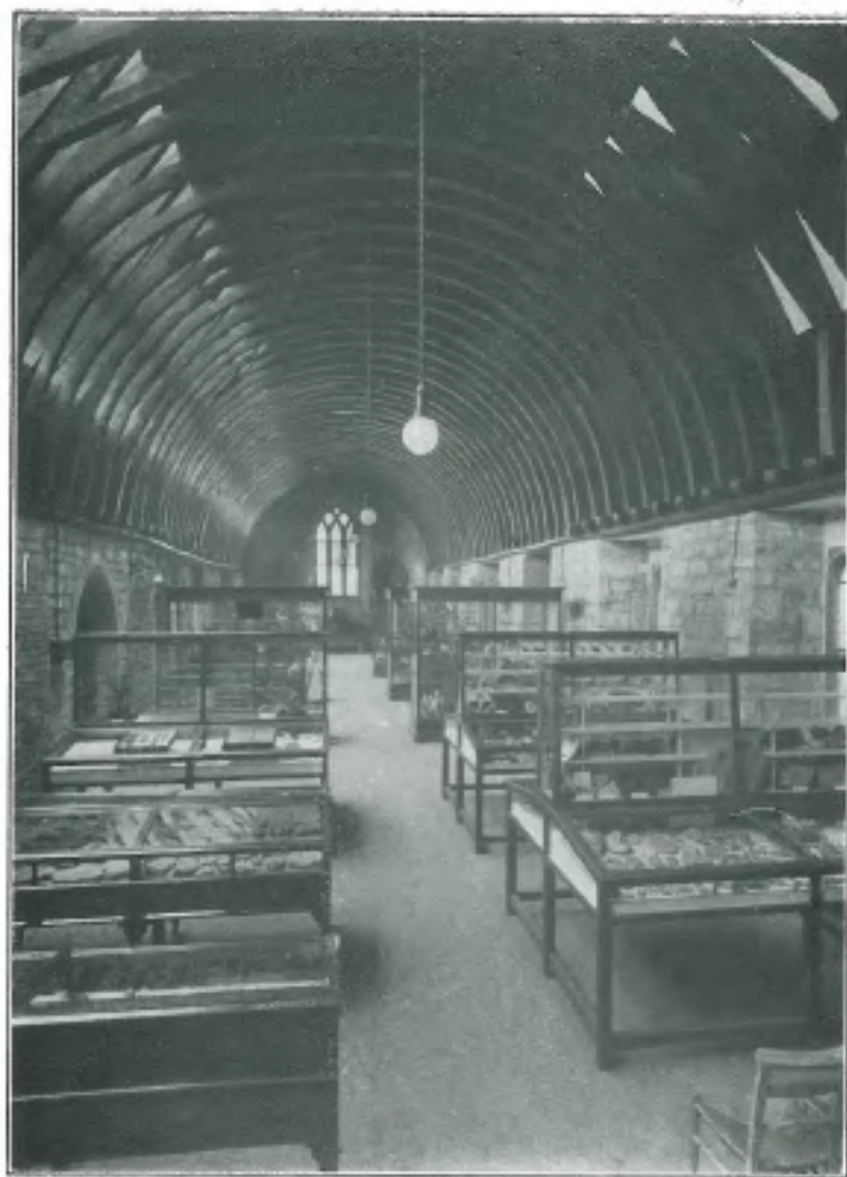
Natural History Room.