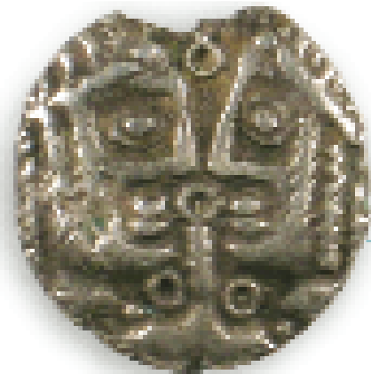
Iron Age coin from Firle, East Sussex (SUSS-B68308)

The Finds Liaison Officer will also be able to inform you of the importance of your material for the understanding of our history. If you would find it useful, your local Finds Liaison Officer will be very glad to pass on to you a report of the information recorded.