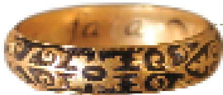
Post-Medieval gold posy ring from Wixford, Warwickshire (2004 T70)

The Coroner will hold an inquest to decide whether the find is Treasure. If the find is declared to be Treasure then it will be taken to the British Museum so that a valuation can be recommended by the Treasure Valuation Committee: this amount is what a museum will pay to acquire the find. However, the Department for Culture, Media & Sport wishes to encourage finders and landowners to consider donating their finds (therefore waiving their right to this financial reward)