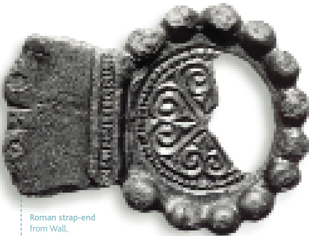
Roman strap-end from Wall, Staffordshire (WMID5951)

All finds are evidence of human occupation and can help us understand more about a particular area or object type. As more and more finds are recorded we will begin to be able to trace patterns in the way they are distributed and these may provide vital clues to the activities of our ancestors. In this way, together we can learn more about our past.