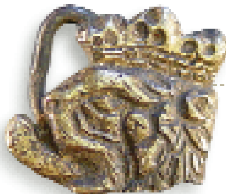
Medieval silver-gilt livery badge from Kellington, North Yorkshire (2003 T402)

The penalty for not reporting a find that you believe (or there is good evidence for believing) to be Treasure, without a reasonable excuse, is imprisonment for up to three months, a fine of up to £5,000 (level 5), or both. You will not be breaking the law if you do not report a find because you did not at first recognise that it may be Treasure, but you should report it once you realise this.