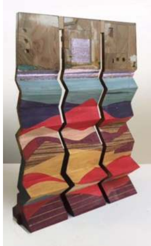
139. Steve Cook Unfolding Seascape Series: 1 Wood, veneer, gilding. £225