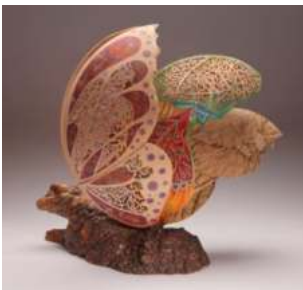
158. Joey Richardson From the Bark Sycamore, box elder, burl, acrylic colours £2,800