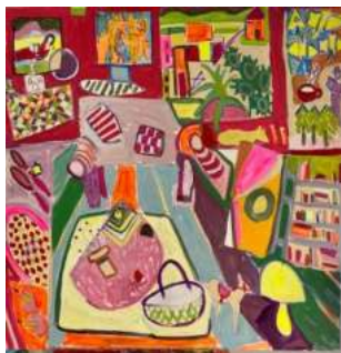
57. Janice Kok Studio IV Acrylic £390