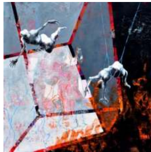
94. Szilvia Ponyiczki Lost Souls Acrylic on canvas