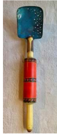
154. Ann Povey Vintage Rolling Pin Spoon Copper, enamel & found object £125