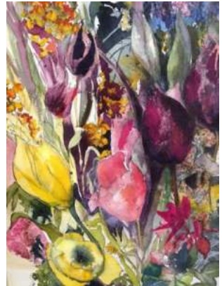
45. Denise Hawthorne Spring Flowers 2 Collage, watercolour £350