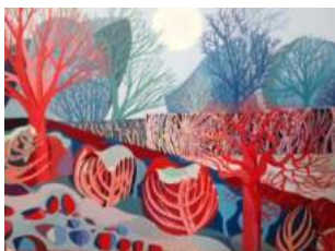
100. Clive Redshaw February Under Acrylic £320