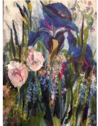
44. Denise Hawthorne Spring Flowers 1 Collage, acrylic £380