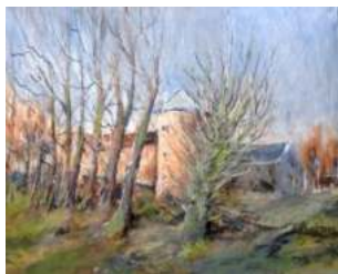
32. Liz Graydon Somerton Castle Watercolour £190