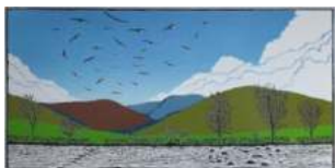
1. Alan Abbey View of Bowland from Whitwell Lino reduction £400