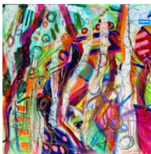
58. Janice Kok Tumbling Mixed media £280