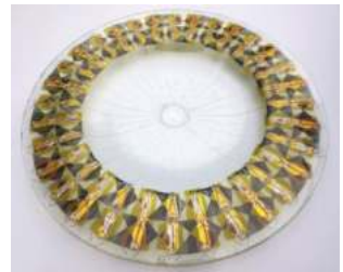
163. Kevin Wallhead Roundhouse II Glass, copper, sterling silver, 24ct gold £350