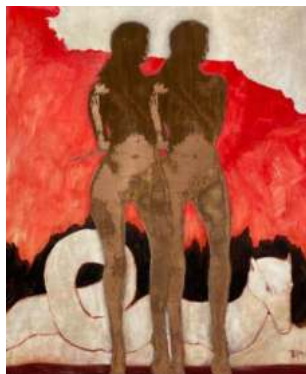
52. Karina Kaye These Violent Delights Oil on board £1,150