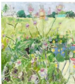
131. Gillian Vines Teasels Oil on paper £380