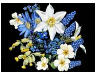
4. M A Addison Blue and Yellow, Colours of Spring 2022 (2) Oil £250