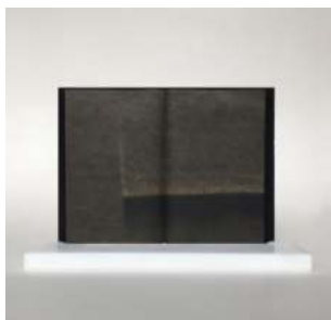
146. Richard Devereux VESSEL vol. IV, 2022 Aqueous polyester, pigment dispersal on bound paper with shelf £950