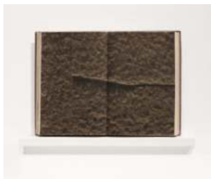
144. Richard Devereux VESSEL vol. I, 2021 Aqueous polyester, pigment dispersal on bound paper with shelf £950