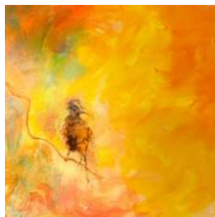
36. Medina Hammad Solitary Now Oil £310