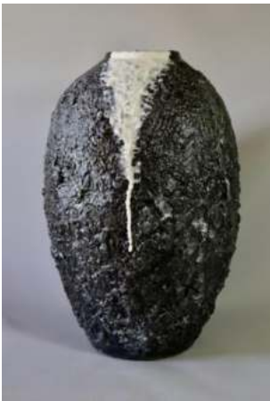
151. Tony Orvis Monochrome Stoneware £100