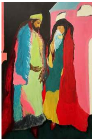
50. Karina Kaye Eye of a Needle Oil on board £1,000