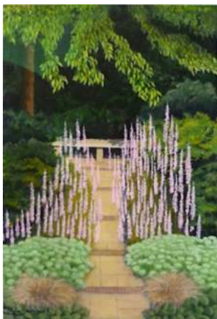
46. Michael Jackson Our Place for Quiet Reflection Acrylic NFS