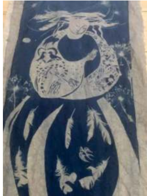
110. Lena Sass Hughes Peace Fabric cyanotype £550