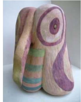
161. Helena Stylianides Troll Buoys Wood & acrylic paint £540