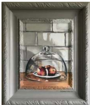
49. Pete Johnston Three Peaches Under Glass Acrylic on birchwood panel and recycled frame £950