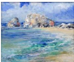
31. Liz Graydon Aphrodite Rock Cyprus Acrylic £90