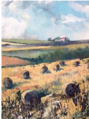
43. Denise Hawthorne August Harvest Acrylic £380