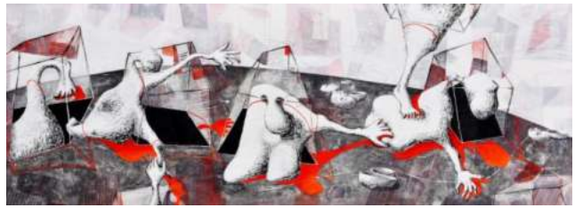
93. Szilvia Ponyiczki Don't - The Faceless Society Acrylic on canvas