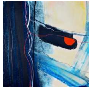
82. David Morris Passage Acrylic £325