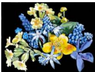
3. M A Addison Blue and Yellow, Colours of Spring 2022 (1) Oil £250