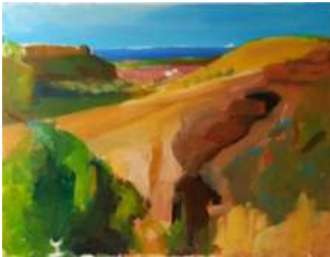
12. Phil Bowman Towards Granada 2 Acrylic on canvas £800