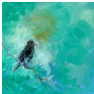
37. Medina Hammad Unrepentant Oil £280