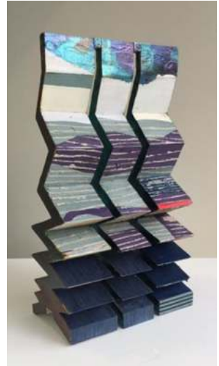
140. Steve Cook Unfolding Seascape Series: 2 Wood, veneer, gilding £200