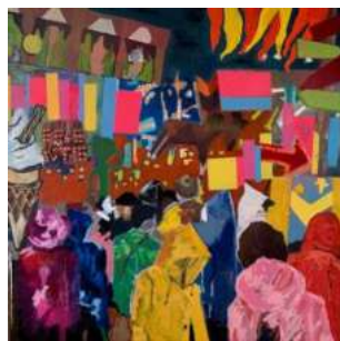
61. Paul Letchworth Festival dreaming Oil on canvas £520