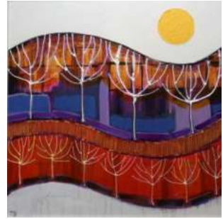
113. Tracey Smith Evening Glow Mixed media £400