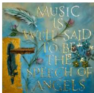
10. Rosi Baxter Music Acrylic and 22ct gold leaf £200