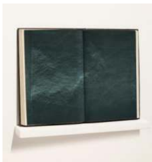
145. Richard Devereux VESSEL vol. II, 2021 Aqueous polyester, pigment dispersal on bound paper with shelf £950