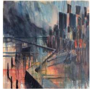
18. Terence Clarke Aftermath Oil £800