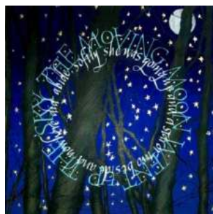
9. Rosi Baxter Moon Acrylic and 22ct gold leaf £200