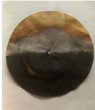
111. Lena Sass Hughes The Dog with the Moon in his Eye Filter paper NFS