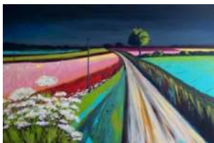
55. Sally Kheng Soaring to the Light Acrylic on canvas £3,000