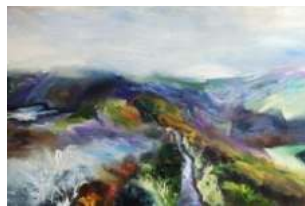
132. Sarah Watson Cornish Walk Oil on canvas £1,200