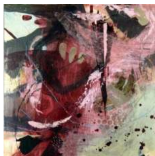
27. Annabel Eley