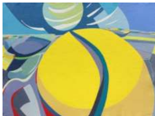
102. Clive Redshaw Sun in Earth Acrylic £320