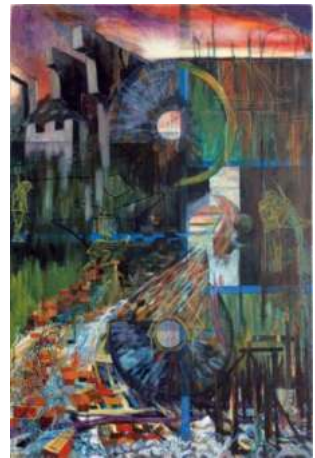
19. Terence Clarke Coastal Matters Oil £700