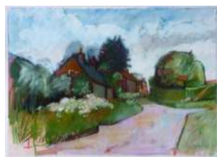
124. Brian Trotter