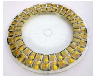
162. Kevin Wallhead Roundhouse I Glass, copper, sterling silver £350