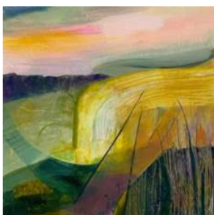
30. Carly Gilliatt The Light at the End of the Day Acrylic and mixed media £450