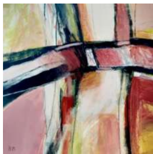
105. Rachel Rogers Field Patterns Mixed media £350