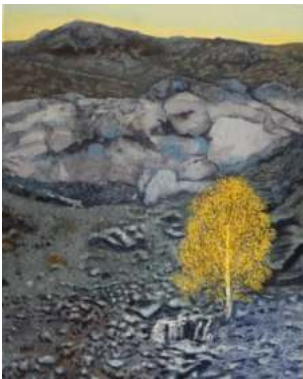
136. Helen Webber Slate Quarry, Ballachulish Acrylic on board £350