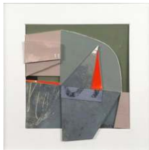
60. Agnieszka Kowalska Grey no 2 Collage on paper £220