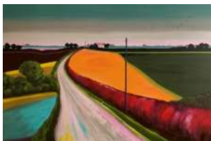
54. Sally Kheng Land of Liberty Acrylic on canvas £3,000