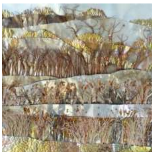
56. Jeanette Killner The Towpath in Winter Metal, mixed media NFS