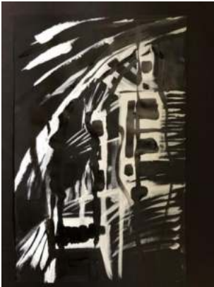
64. Jillian Lewis Black on Black 2 Acrylic on pastel paper £75