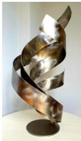
147. Paul Harrison Eternal Flame Stainless steel £375