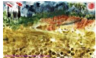
115. Jan Stead My Favourite Field - Stacks Peep Through Monotype £80