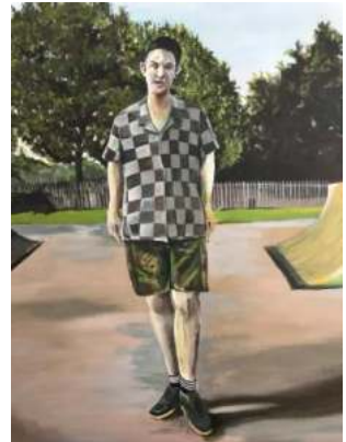
97. Samuel Randall Culture Acrylic on wood