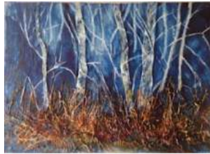
15. Gillian Boyle Twyford Woods at Dusk Mixed media £175