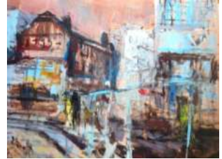
69. Robert Machan Building Site Carver Street Oils £300