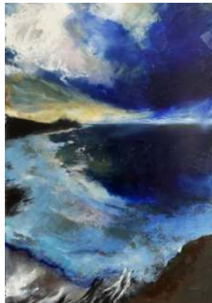
133. Sarah Watson Sundown Over Crackington Beach Oil on canvas £900