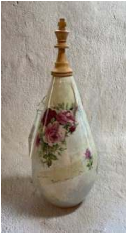
156. Ann Povey Tall Vessel Ceramic & found objects £135