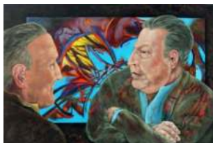
129. Graham Underhill Two Men discuss Abstract Values Oil on canvas £650