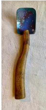
153. Ann Povey Axe Handle Spoon Copper, enamel & found object £120