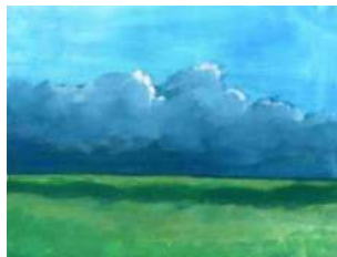
112. Peter Slater Bardney Storm Acrylic on canvas £150