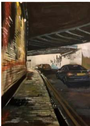
98. Samuel Randall Tunnel Acrylic and ink on paper £250