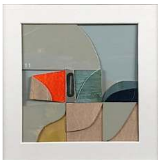
59. Agnieszka Kowalska Grey no 1 Collage on paper £220