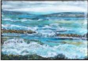
107. Barbara Rontree Burren Wish Encaustic paint (hot beeswax, damar resin and pigment) £190