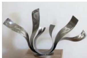
148. Paul Harrison Six Waves Stainless steel £325