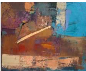
137. Anne Wood Happy Ending Oil £850