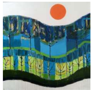
114. Tracey Smith Morning Glow Mixed media £400