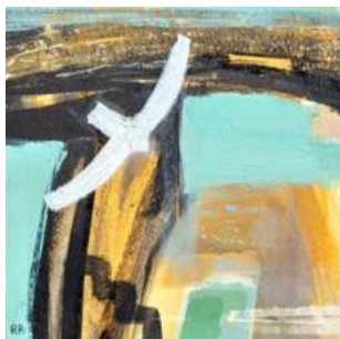
103. Rachel Rogers Above the Harbour Mixed media £250