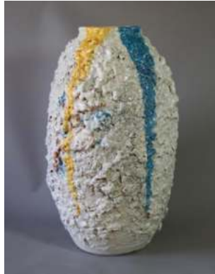
152. Tony Orvis Ukraine Stoneware £100