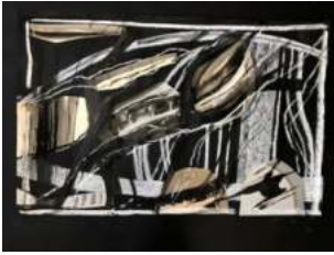
63. Jillian Lewis Black on Black 1 Mixed media £75