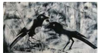
116. Jan Stead Pied Beauty - Two for Joy Monoprint £80