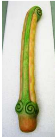
160. Helena Stylianides Tendrill Wood & oil tints £485