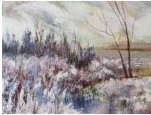
42. Denise Hawthorne Hard Frost Acrylic £380