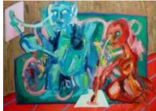
16. Hannah Cawthorne The Artists Acrylic on canvas £750