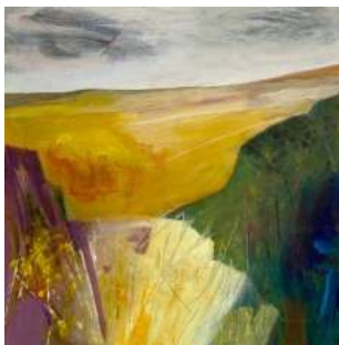
29. Carly Gilliatt A Little Bit Wild Acrylic and mixed media £450