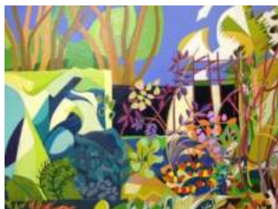
101. Clive Redshaw October Still Acrylic £320