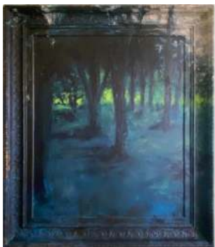
48. Pete Johnston Before The Storm Acrylic on birchwood panel and recycled frame £1,200