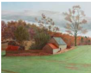
126. Graham Underhill Barns, Early Spring Oil on canvas £920