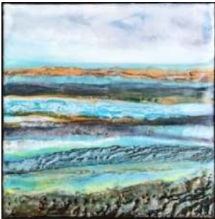
108. Barbara Rontree Strata Encaustic paint (hot beeswax, damar resin and pigment) £160