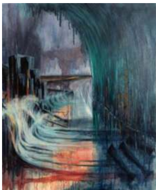
20 Terence Clarke