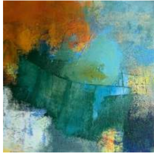
138. Anne Wood Rest Awhile Oil £850