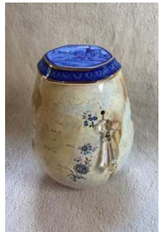
155. Ann Povey Blue Vessel Ceramic & found objects £135