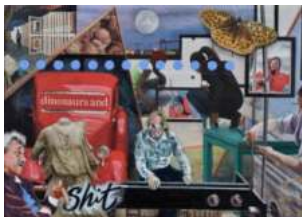
79. Geoffrey Mark Matthews Permovetur ac Praegratuata Collage and acrylic on canvasboard £250