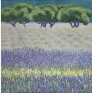
135. Helen Webber Lavender and Olive Trees Acrylic on canvas £400