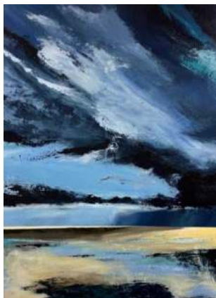
5. Rachel Ashworth-Jerem Fitties Beach Acrylic on canvas £850