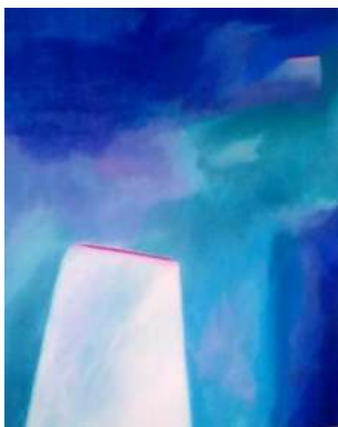
21. Lynne Corcoran