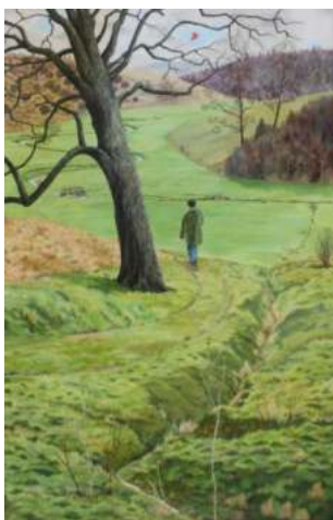
127. Graham Underhill Bridge 1 Oil on canvas £1,670