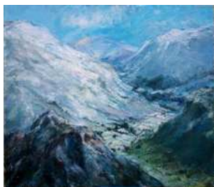
7. Clifford Baxendale Helvellyn 5 Oil £500