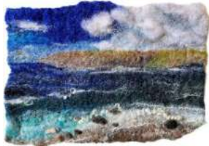
76. Eve Marshall The Shore Felted wool £300