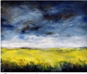
38. Anne Harris Big Skies Acrylic £550