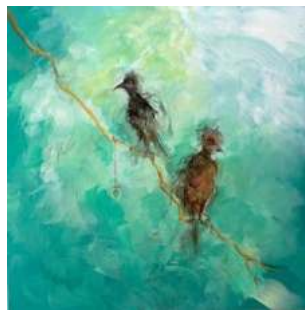
35. Medina Hammad Hanging by a Thread Oil £280