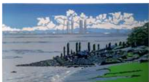
2. Alan Abbey Humber Past and Present Lino reduction £400