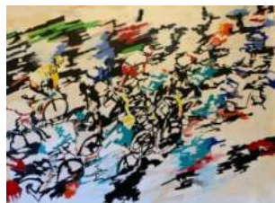
62. Paul Letchworth Break Acrylic on linen £1,450