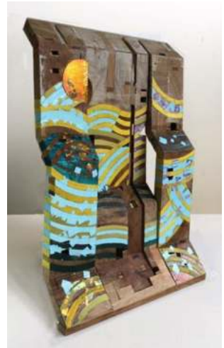
141. Steve Cook Unfolding Seascape Series: 3 Wood, veneer, gilding. £250