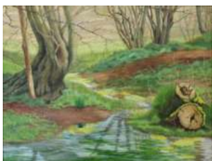
128. Graham Underhill Pond, Spring Oil on canvas £950