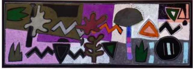
66. Lyn Lovitt Zig Zag Oil pastels on Somerset Paper £400