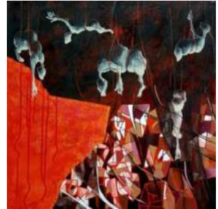
96. Szilvia Ponyiczki The Challenges of Life Acrylic on canvas