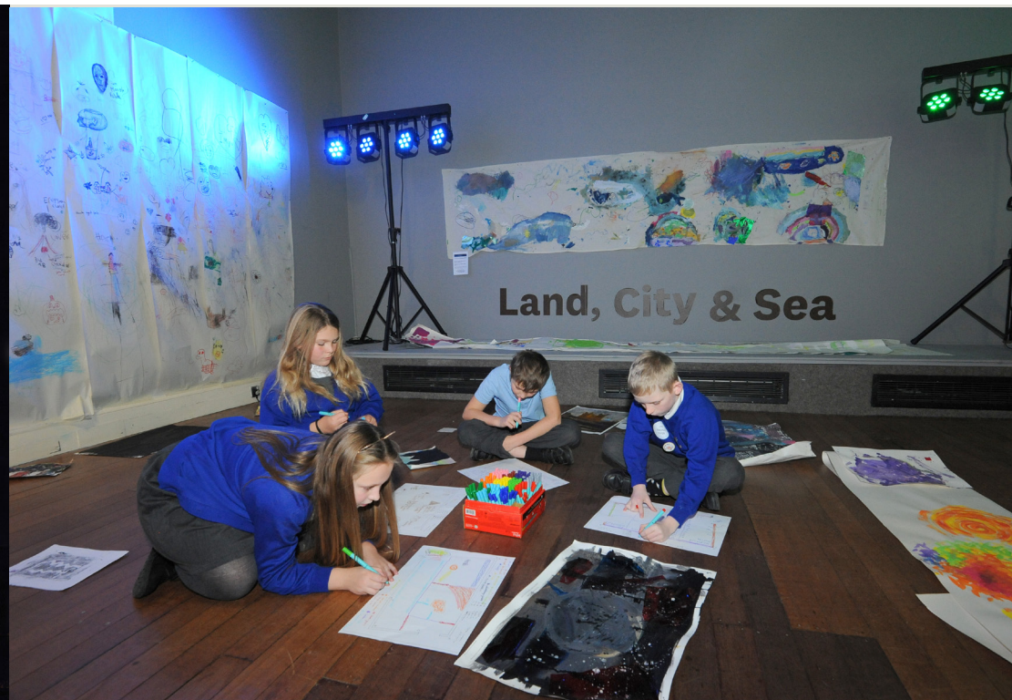
Young artists responding to the exhibition.