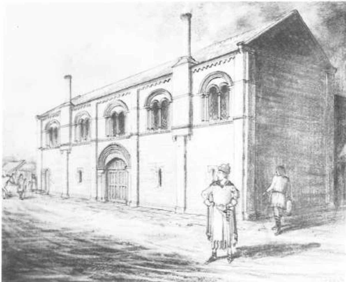
A reconstruction drawing of St. Mary's Guildhall, High St. showing how it might have looked in its original form.