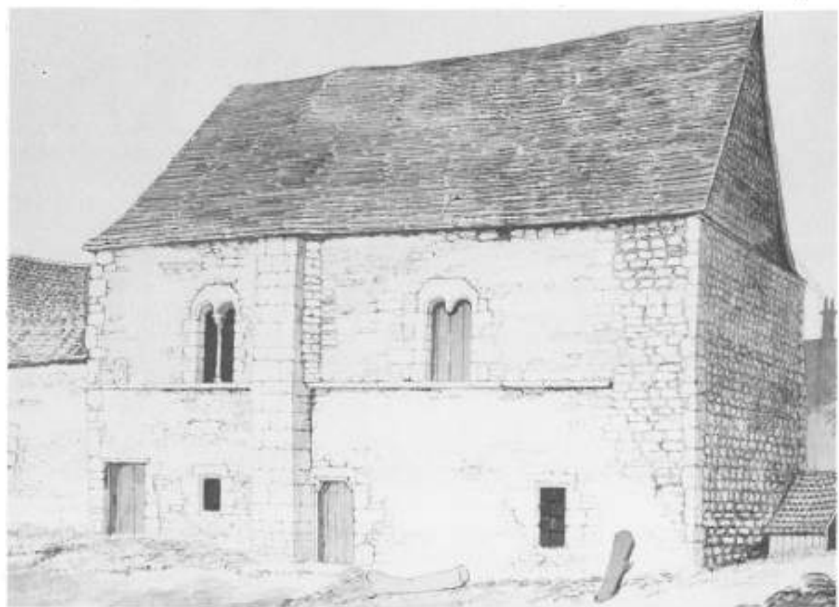
Drawing by H. Grimm showing the so called 'Norman House' situated behind the Guildhall.