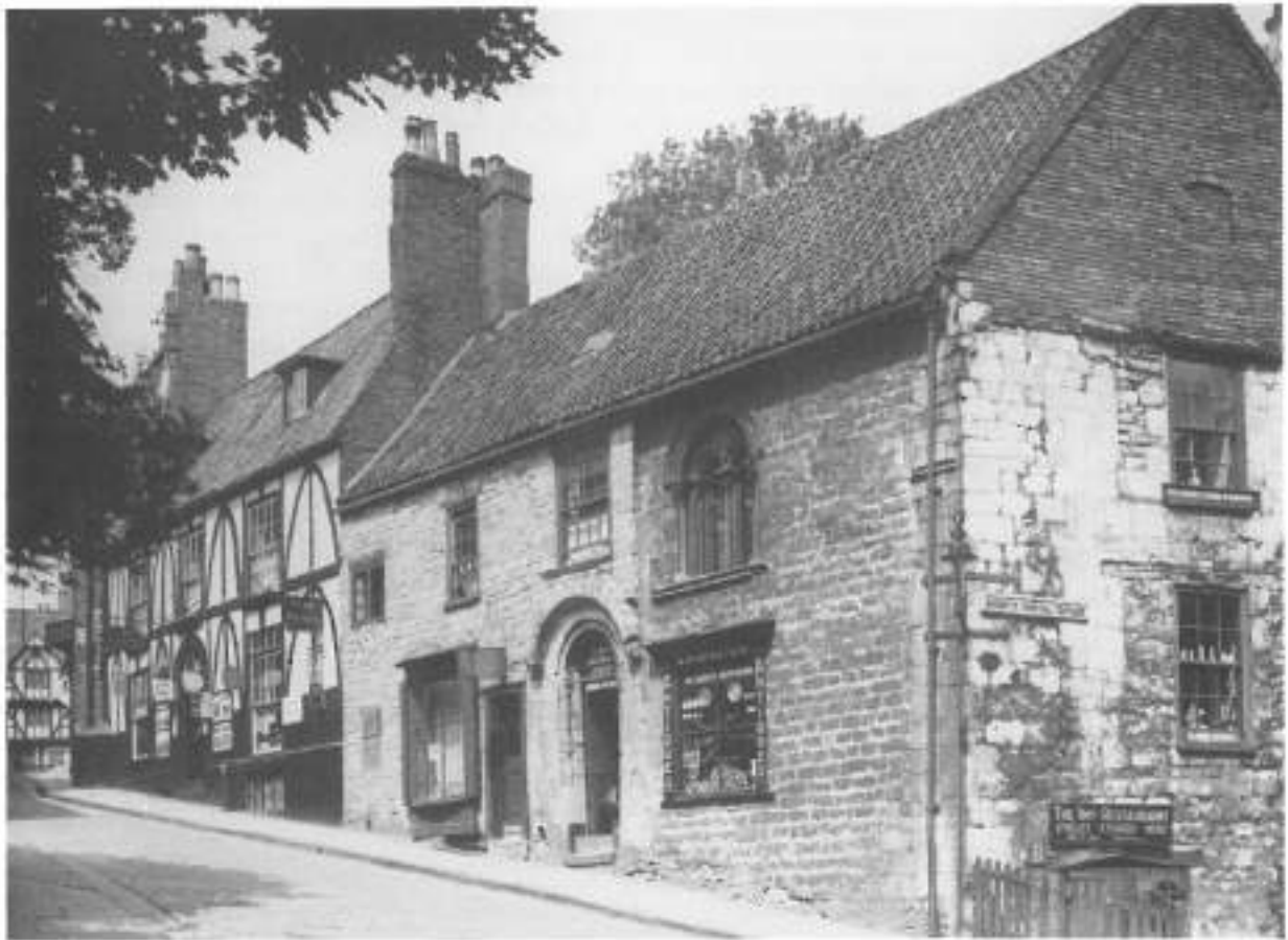
A general view of Aaron the Jew's House 47, Steep Hill.

An unusual feature which can be seen at both these houses is the centrally placed ground-floor main entrance.