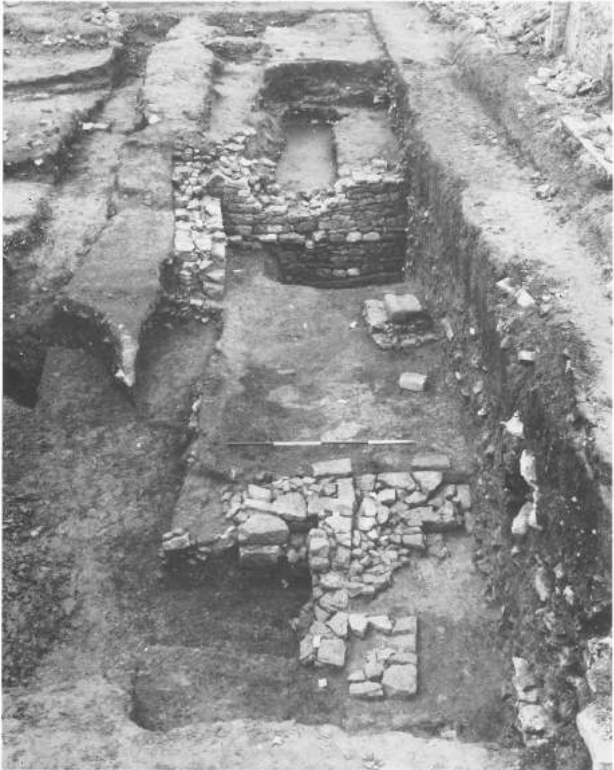
Danes Terrace, Lincoln during excavation. The stone footings of medieval houses can be clearly seen.

The buildings described above are the best preserved examples of Norman architecture surviving in Lincoln today. There are other fragmentary remains to be found elsewhere in the city. These are all in the Cathedral area and would have been inhabited by Cathedral dignitaries. The major sites are described below.