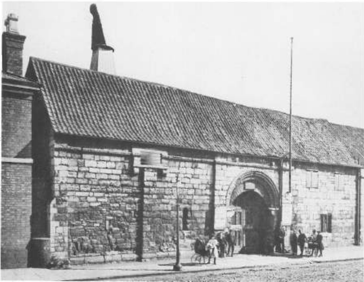
This late 19th century photograph of St. Mary's Guildhall illustrates the modification of the chimney buttress since the time of Grimm.

Above can be seen an ornate string-course carved with scrolls, plant designs and fantastic beasts, giving some idea of the superb quality and high status of the original building. To the north of the main gateway can be seen an original Norman loop window, wider on the inside than the out.