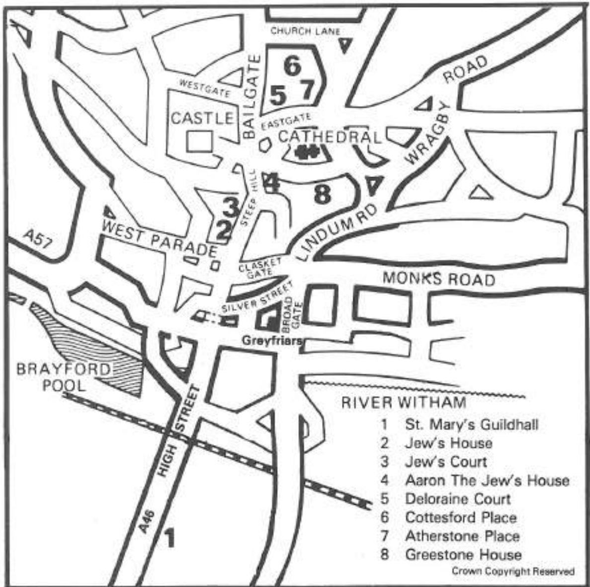
Map showing location of Norman Buildings in Lincoln.