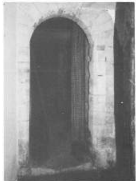
Details of Aaron the Jew's House showing the main entrance, reconstructed first floor window, and the rear doorway.