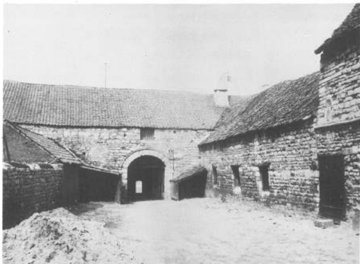
This photograph of the same date illustrates the courtyard behind the street frontage.

stonework, but the majority of the remaining building appears to be of a much later date copying the Norman style.