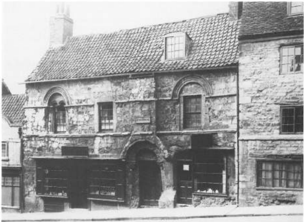
A more recent view of the Jew's House, showing the changes since Grimm's earlier sketch.

removed to make way for a modern sash. A second string-course runs along the building at the level of the sills.