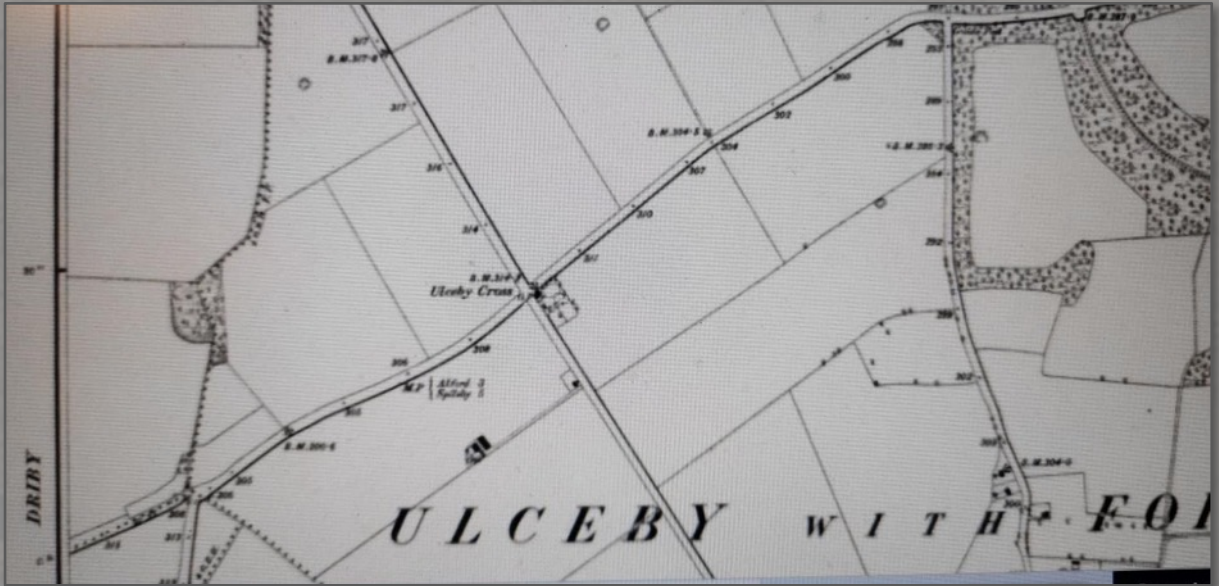
Fig 1 - 1887 6" OS Map of Ulceby Cross, Lincolnshire.